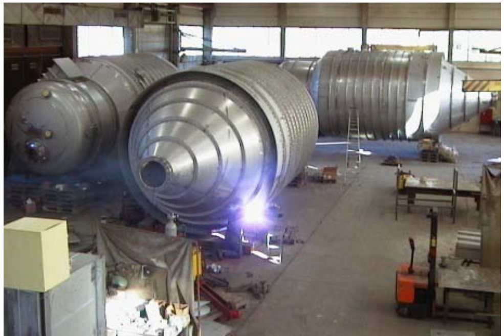
Fabrication of flash vessels for a forced circulation evaporator